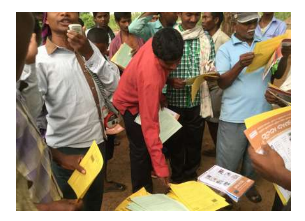
Sharing of information in local markets

At the end of the project it is observed that though regularity of children in school & AWC is not so encouraging but 100% enrolment is achieved so far our project action area is concerned. Though few steps have been taken through the project towards ensuring 100 days work or as demanded by the job seekers but not yet achieved much. We have achieved success in ensuring people's especially women participation in local self governance and government sponsored schemes / programmes.