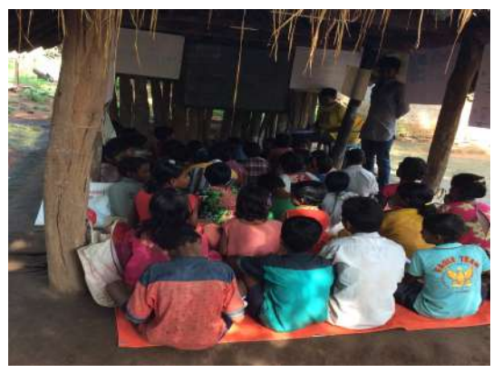
During class transaction in night School